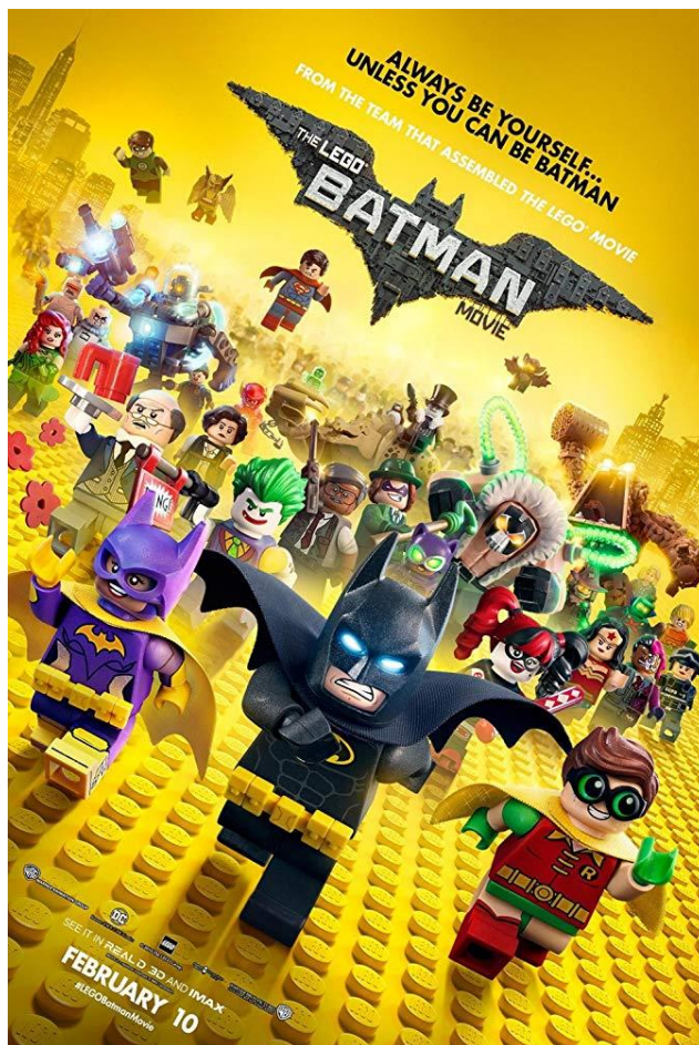
Poster for The Lego Batman Movie (2017)

The MPAA’s members and their affiliates have also licensed numerous “crossover” comic books mixing cartoon, film and/or television characters. Such publications frequently entail licensing arrangements between competitors and some, notably, have included “mashed up” characters and characters from Star Trek :