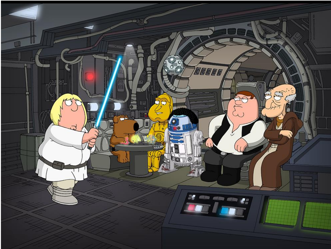
Still from Family Guy “ Blue Harvest ” episode (2007)

Family Guy , featuring Star Wars characters rendered in the distinctive cartoon style of the television show: